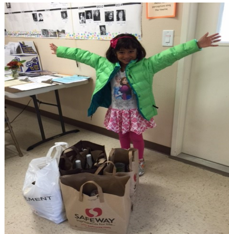
Uma brought in her weight in food donations.