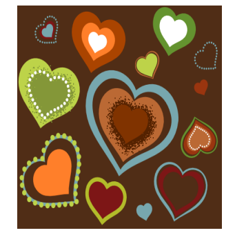
Love is the Fabric of Community