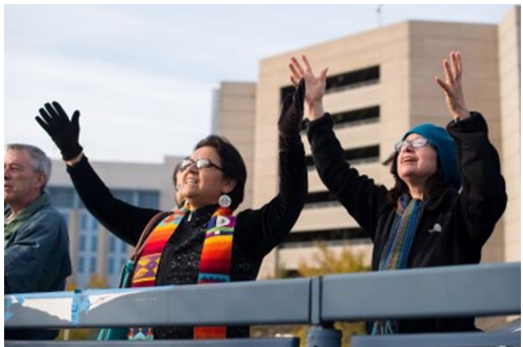
Outside the Suffolk Detention Center at monthly vigil in solidarity with immigrants