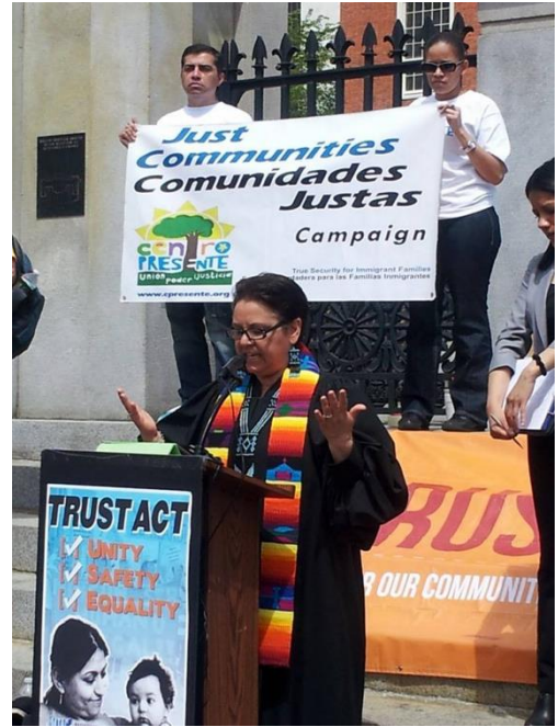
At the Massachusetts State House offering a prayer before testifying in support of the TRUST Act