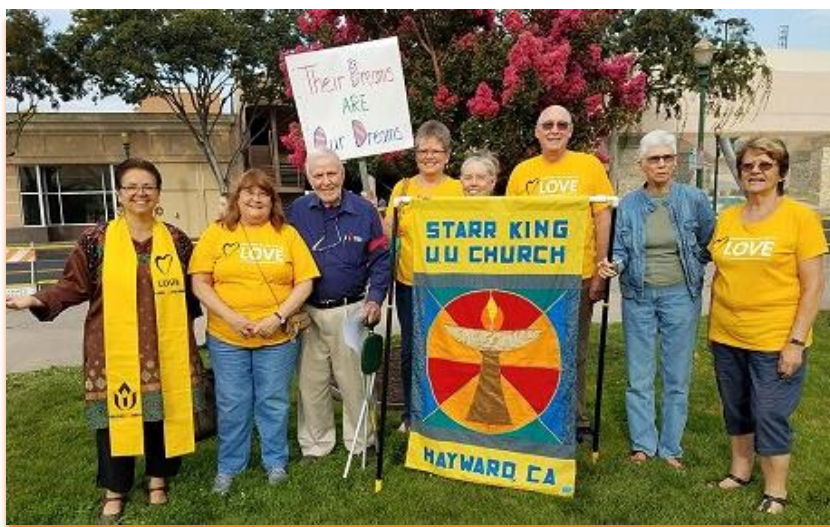
Members support the Dreamers