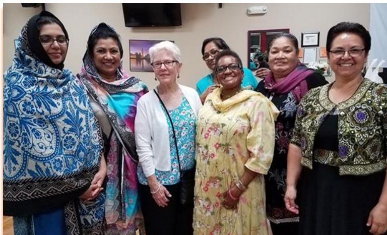
EID Dinner with Interfaith Fellowship