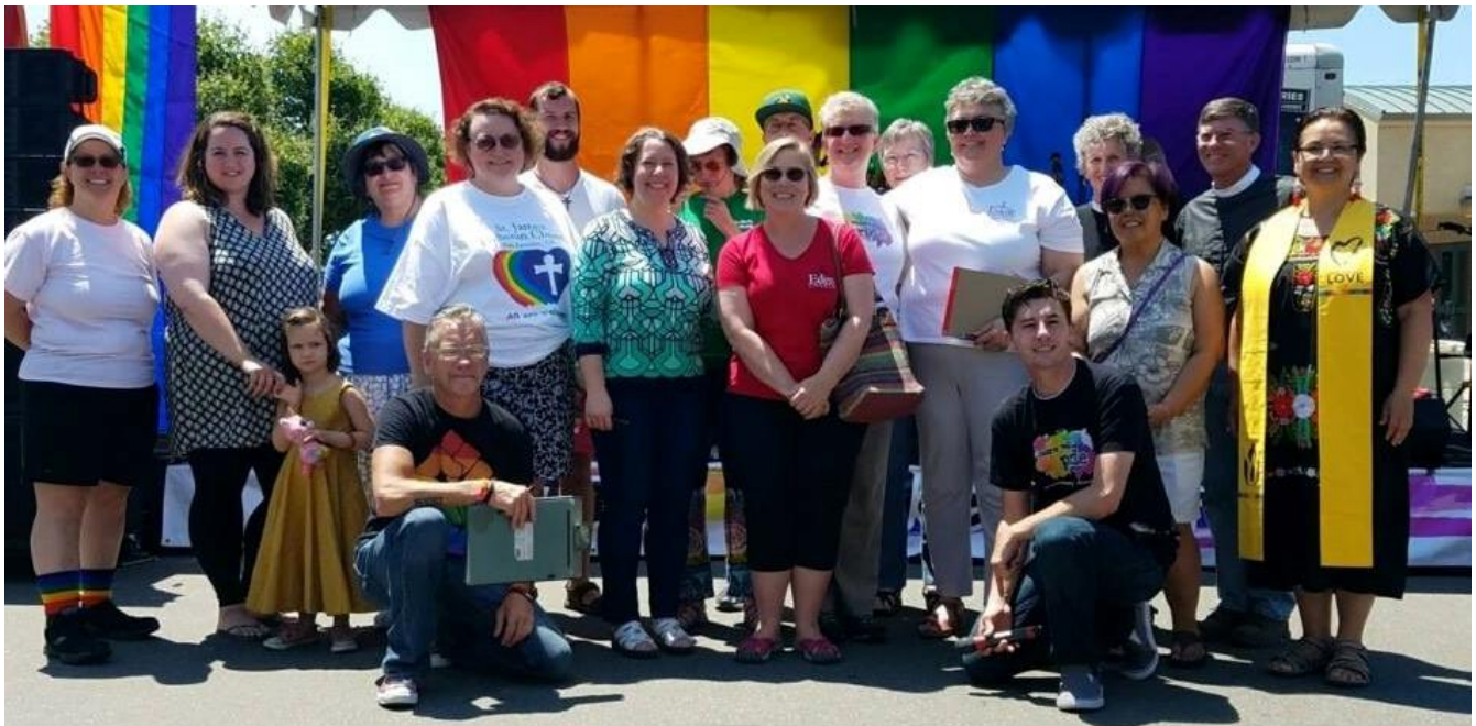
At Castro Valley Pride!