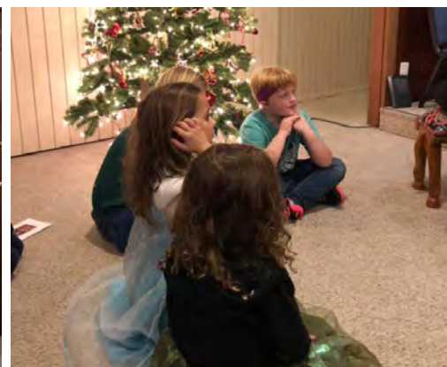
December 22nd Sunday Service