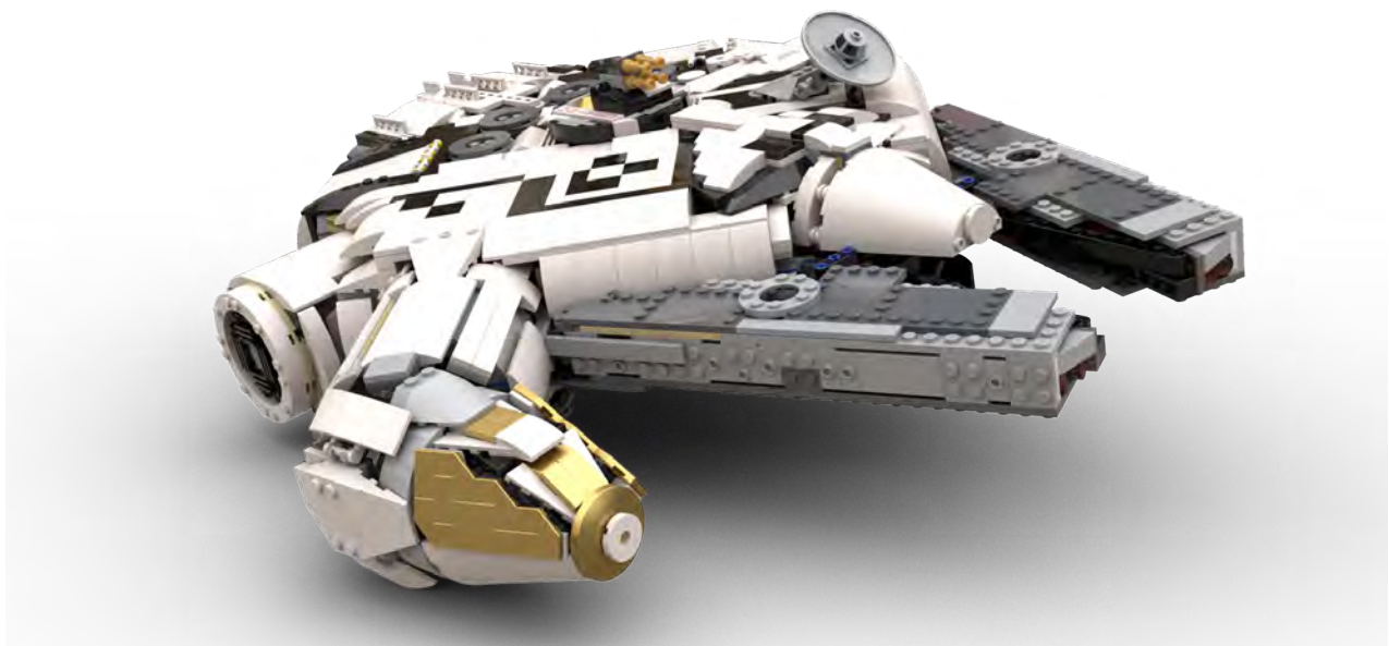
Millennium Falcon made with Saturn V Rocket parts

At first this reunion had more utilitarian purposes. I would plan remodeling ideas for the house by building a scale version of it in Lego that I could rearrange as needed to explore different ideas. Later, as I followed the 50th anniversary of the moon landing, I purchased a Lego version of the Saturn V rocket that helped wrap my head around the amazing engineering that went into that program. That same set would soon ignite my imagination, as I recombined those same pieces to start making custom models.