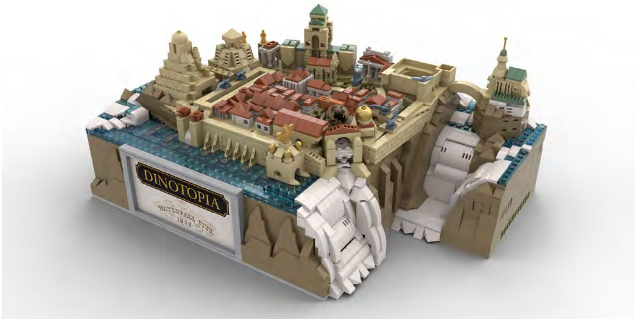
Model of Waterfall City from Dinotopia

My career had mostly focused on storyboards for video, so I already needed to think spatially in three dimensions to visualize how characters and props in a specific location could be arranged and what camera angle to use to form the right composition for a shot. With Lego I think similarly, though instead of imagining something's depth and breadth I can literally form it. As a creative person that also has appreciation for organized systems, including things like puzzles and Ikea furniture, I would consider myself well suited for the medium. So I continued building throughout the pandemic in my spare time.