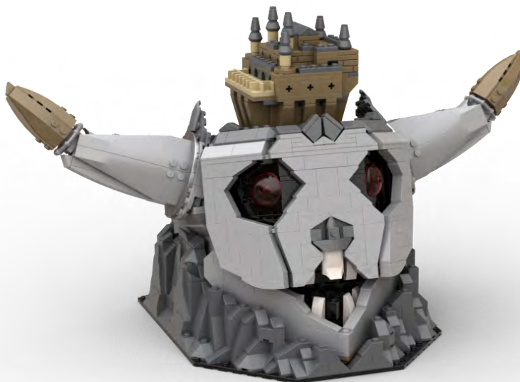
Model of the Castle of Grim

So back to those quotes at the top. I'm astronomically lucky enough to get a job doing what I truly love, working in Lego, but what about putting aside childish ways? Rather than accepting the pejorative childish descriptor, I prefer instead to see it as childlike, embracing wonder and imagination as a positive thing in life.